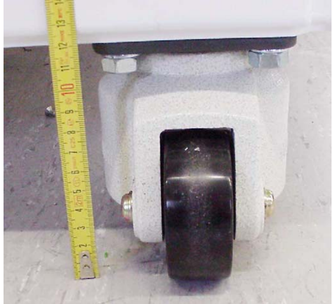
New design with a height of 120 mm